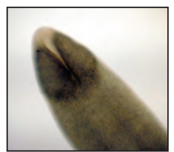
Bothria (grooves) in plerocercoid scolex characteristic of Diphyllobothrium sp.