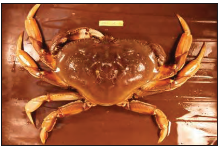
Typical Dungeness crab