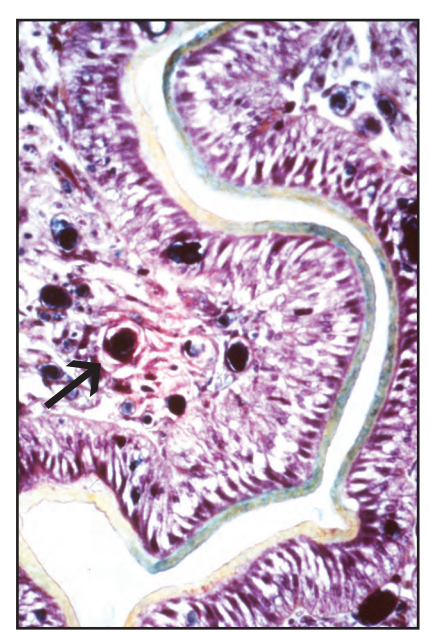
Histological section of smaller type 1 granulomas (arrow) in the midgut connective tissues of Dungeness crab