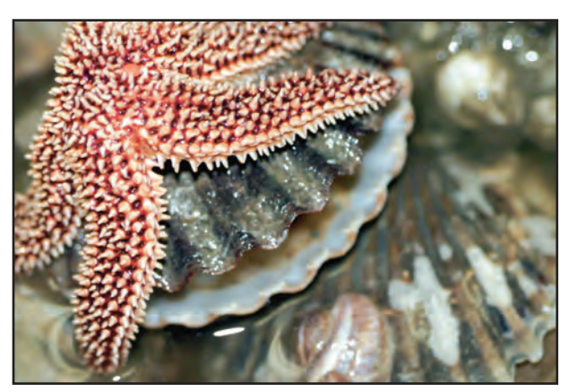
Starfish predation on bay scallop