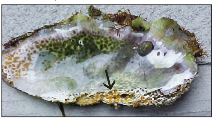
Boring sponge etching (arrow) that has penetrated to the internal shell surface of the same oyster