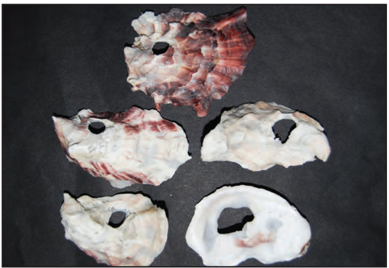
Irregular to round holes in the shells of juvenile Pacific oysters produced by crab predation

There is no zoonotic human health concern with the presence of invertebrate predators or pests associated with bivalve molluscs except for the potential loss of aesthetic quality to the consumer.