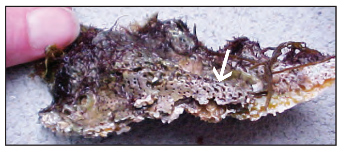
Boring sponge etching (arrow) on the external shell of a Pacific oyster