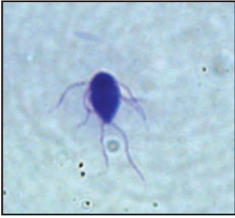
Hexamita sp. in a Giemsa stained smear