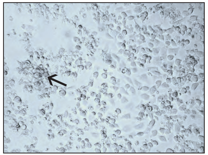
CPE in CHSE-214 cells showing areas of cell rounding and necrosis (arrow) typical of Aquabirnavirus