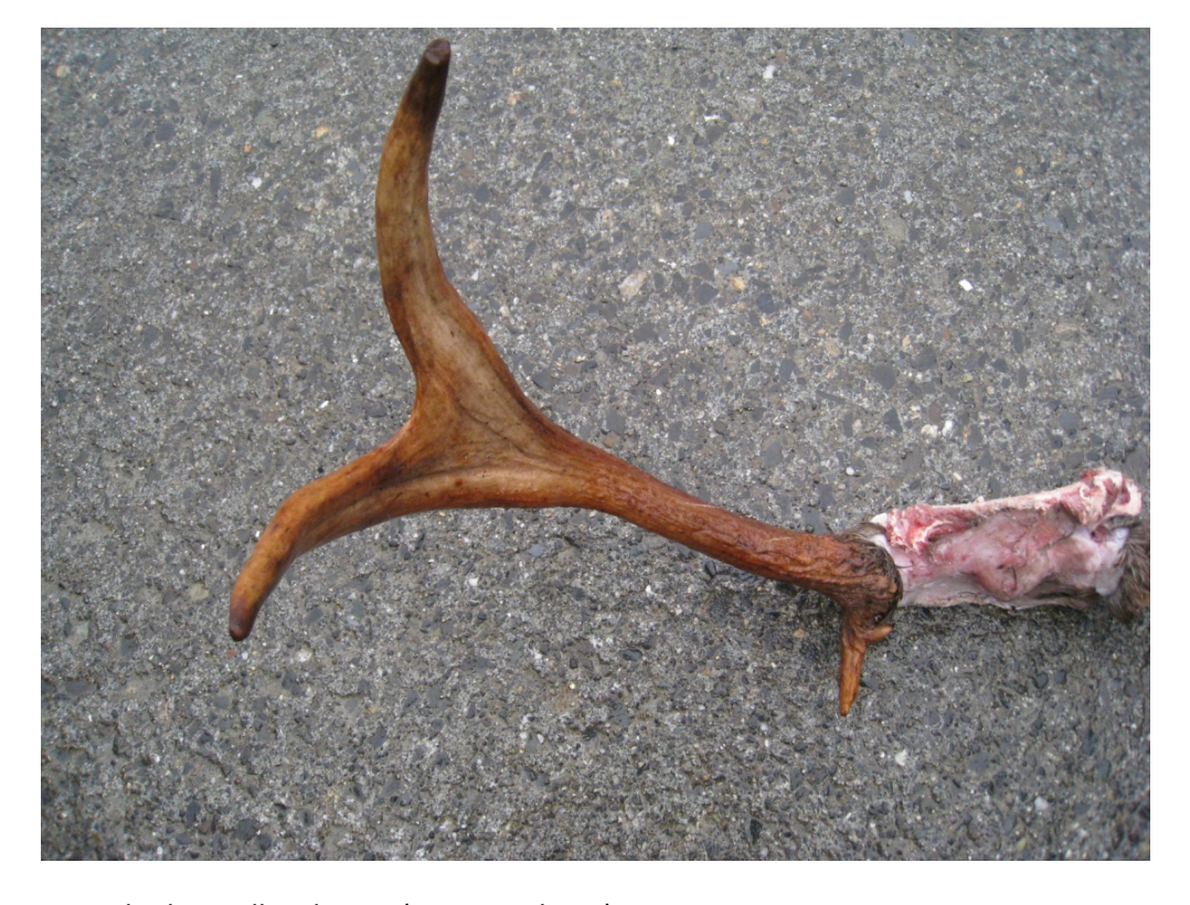
Example three: Illegal 2011 (same as above)