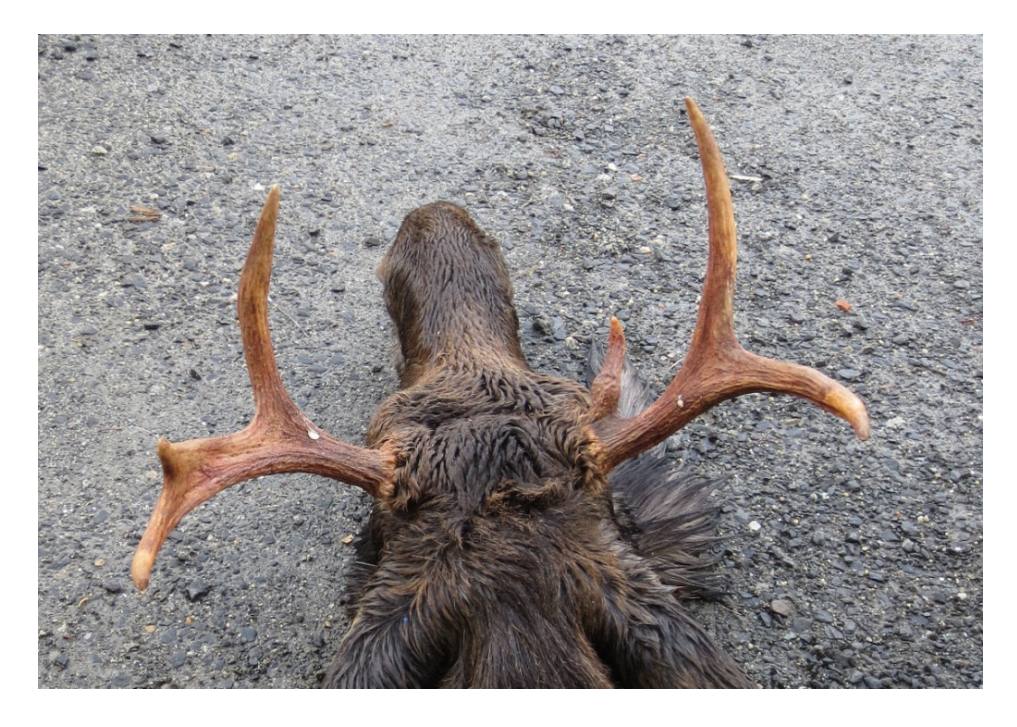
Example four: Illegal 2013