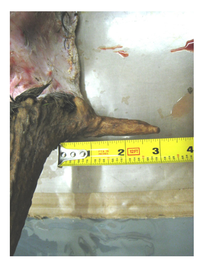
Example three: Illegal 2011 (same as above)