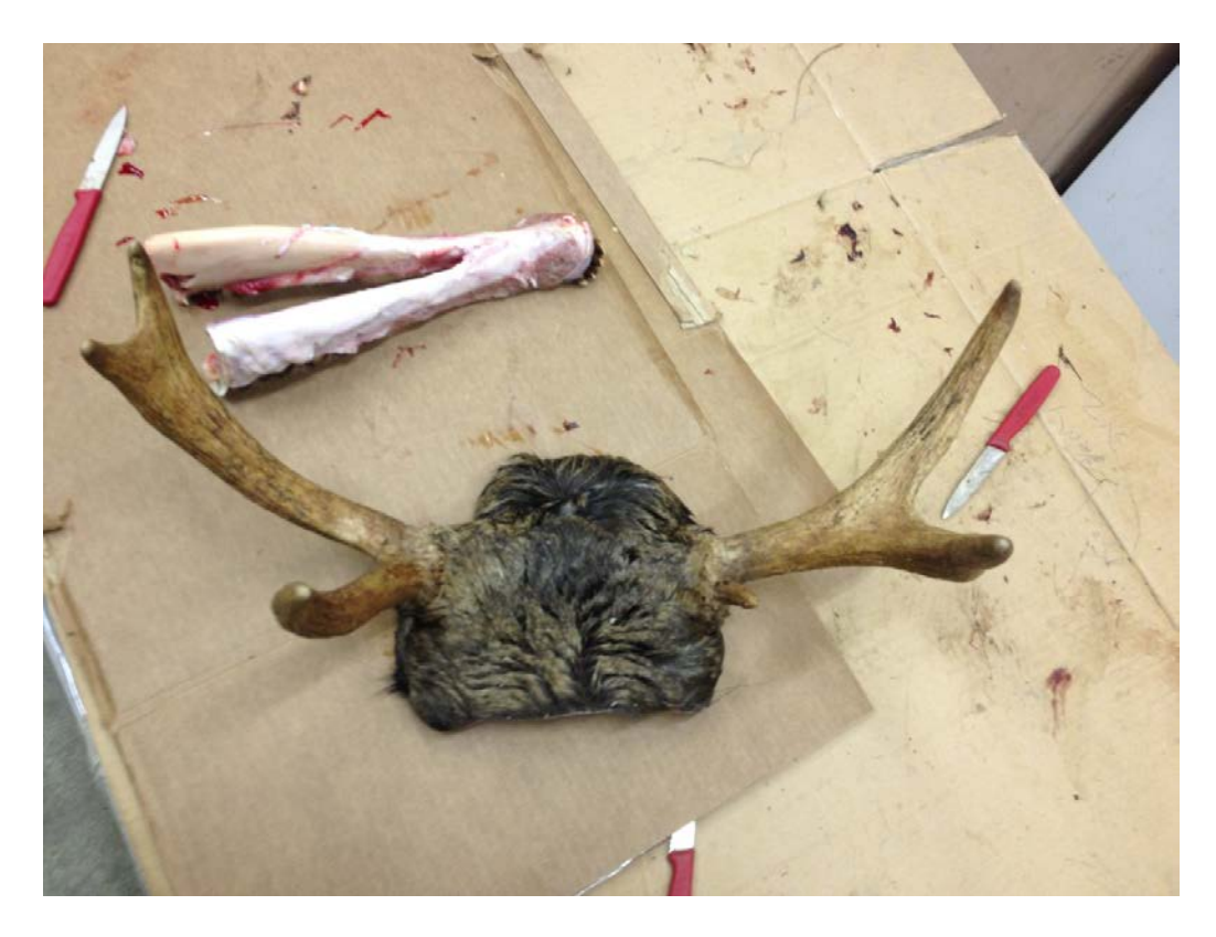
Example five: Illegal 2015