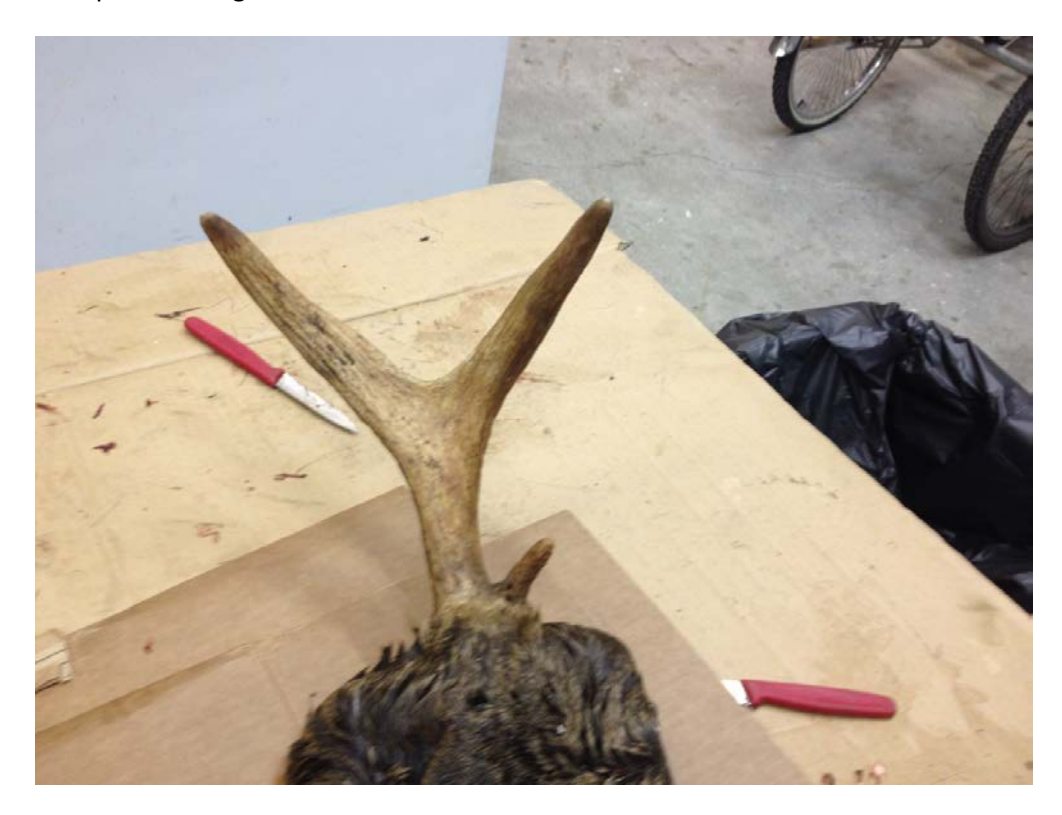
Example five: Illegal 2015 (same as above)