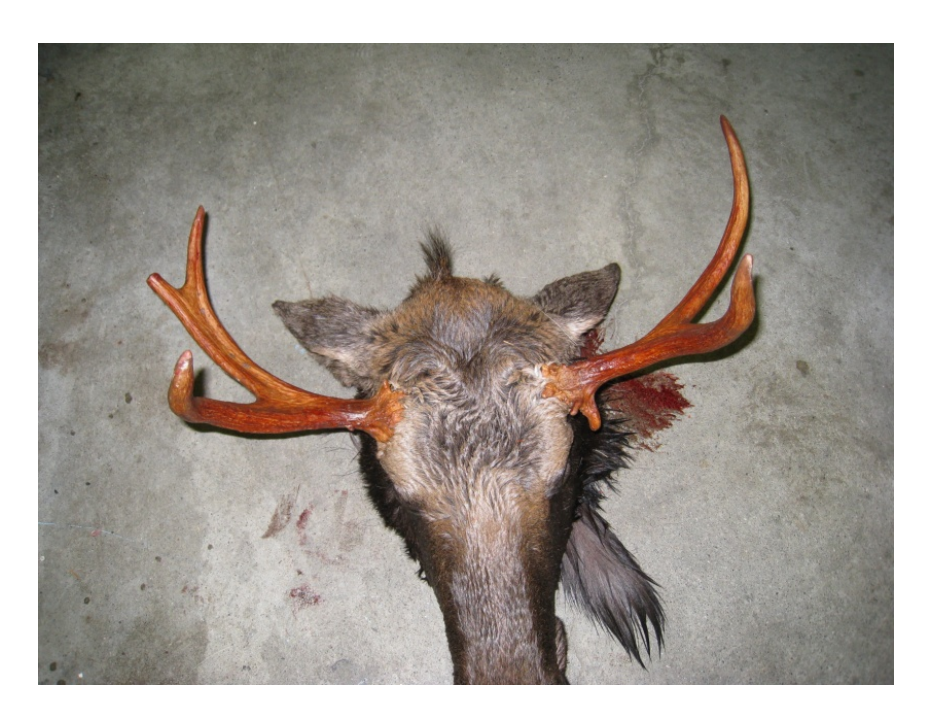
Example two: Illegal 2008