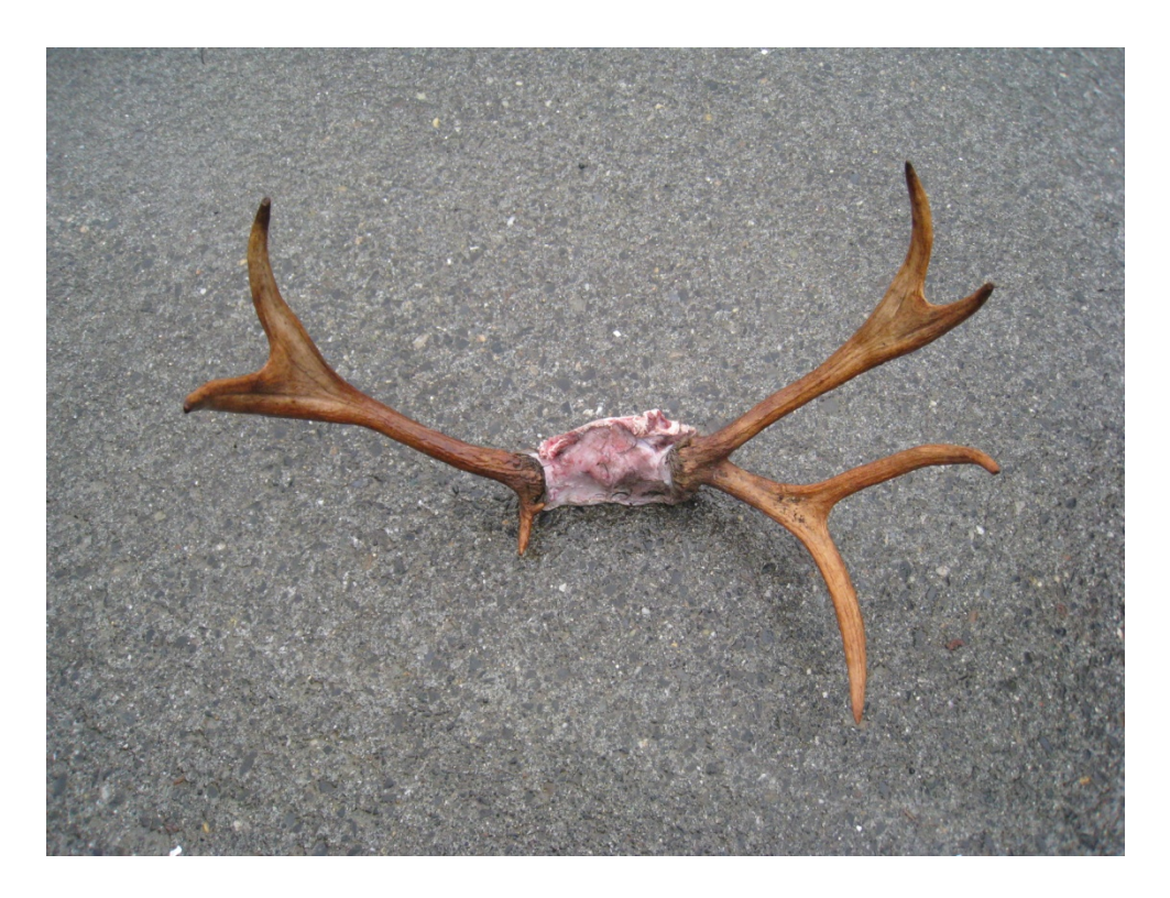
Example three: Illegal 2011