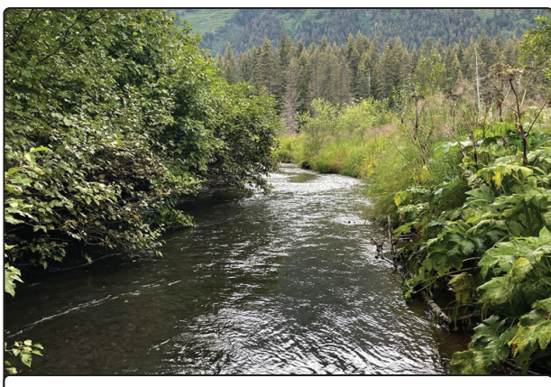
Creek fishing views.