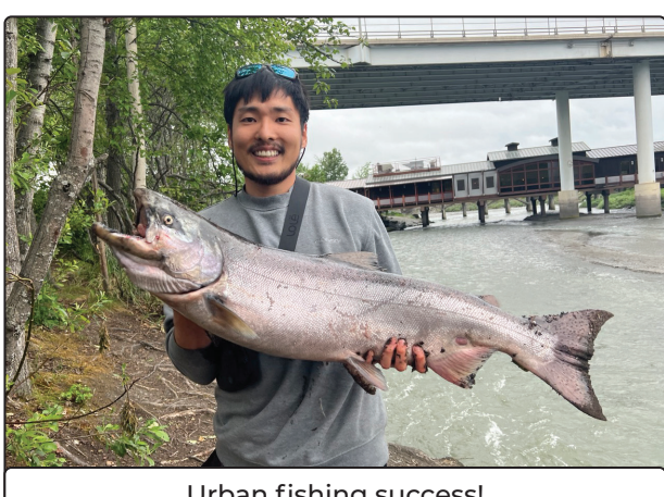
Urban fishing success!