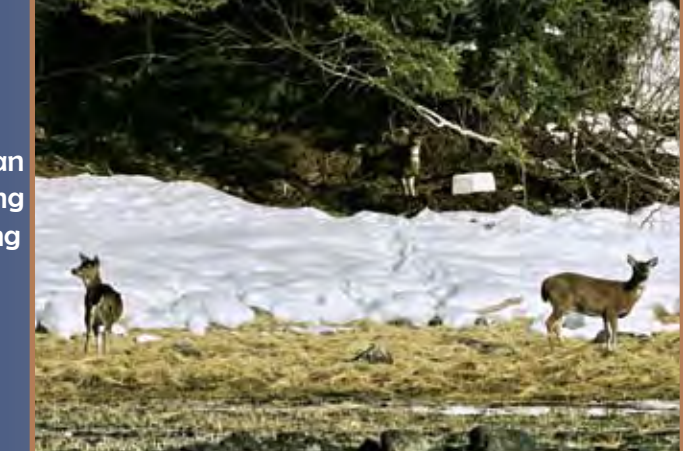
Does and fawn/ yearlings are often seen together and can be observed squatting to urinate, confirming their gender.