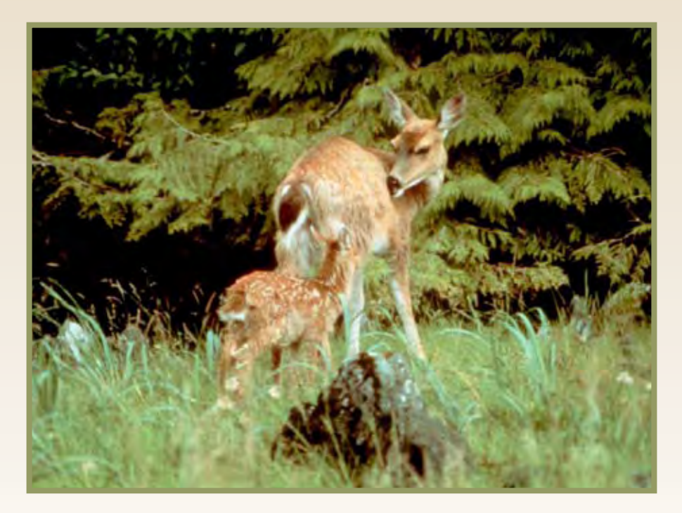
Upper left photo: Deer browsing on alder buds along the beach fringe of Chichagof Island after heavy snowfall in November 2007. Photo above: Doe with fawn, mid-summer on Prince of Wales Island.

As tragic as these winters can be, deer populations will usually return to previous levels. Fortunately, deer have a very high reproductive potential (early age at first reproduction, high pregnancy rates) and once favorable conditions return, deer populations are capable of rebounding within a few years, provided rates of predation and hunting pressure are not too high.