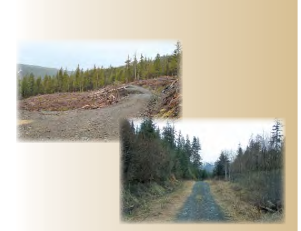
Photos A (left) B (right): On much of Prince of Wales Island, the view from the road has transitioned from "A" to "B" making the spot, stalk, and harvest more challenging.

Biologists believe that logging old-growth forest will result in a long-term decline in carrying capacity for deer. Additional research focusing on how deer densities change with forest succession and changes in access will be critically important when evaluating and modeling the sustainability of the hunting system. This information will be needed before wildlife researchers, forest managers, and local hunters can confidently move forward together toward a more sustainable hunting system.