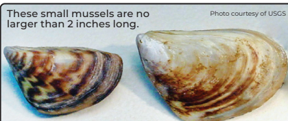
These small mussels are no larger than 2 inches long.