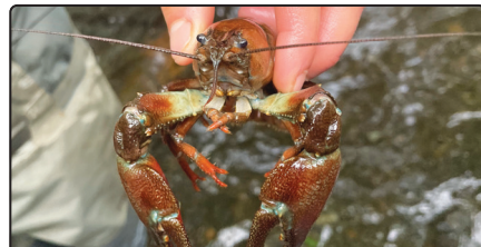
Signal crayfish are currently in the Buskin Watershed on Kodiak Island.