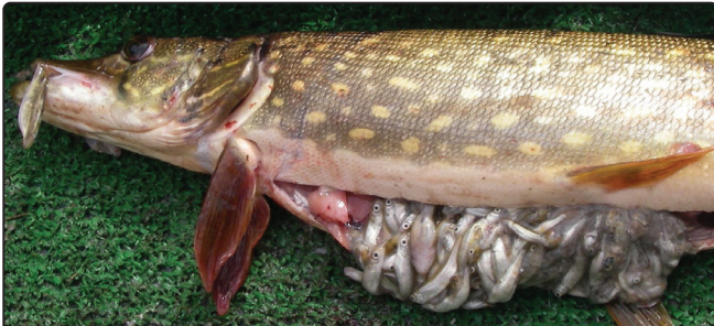
Northern pike are only invasive in Southcentral Alaska. They are native fish species in Northern and Southwest Alaska.