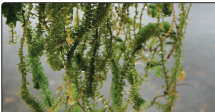
Elodea is currently found in Northern and Southcentral Alaska.