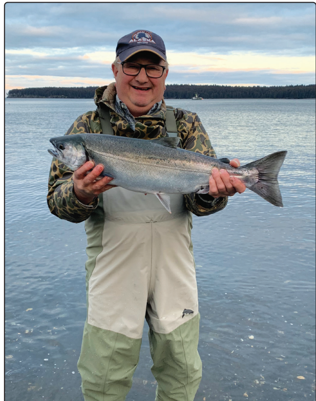
A successful day of shore fishing.