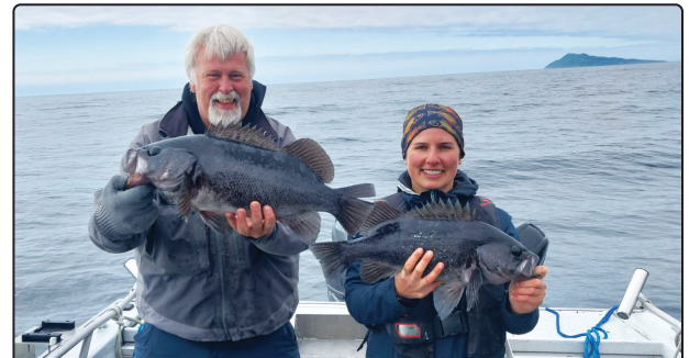
A couple of black rockfish from the Kodiak area.